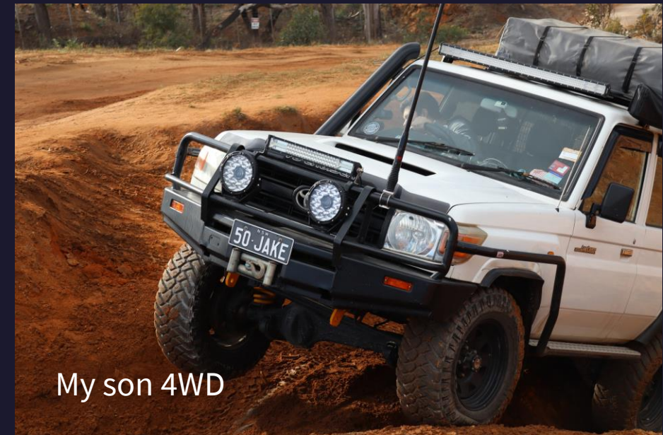
My son 4WD