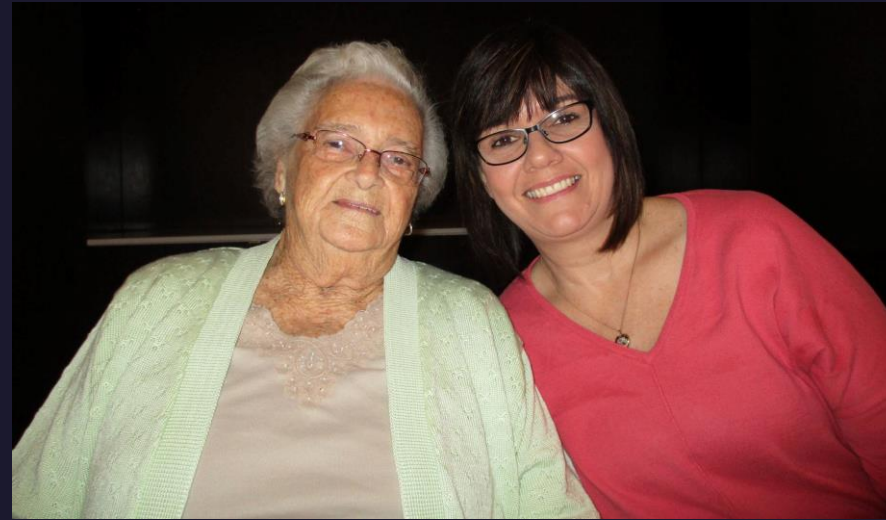
My grandmother, what an inspiration

When we go camping I sleep on a tent on the roof of our car.