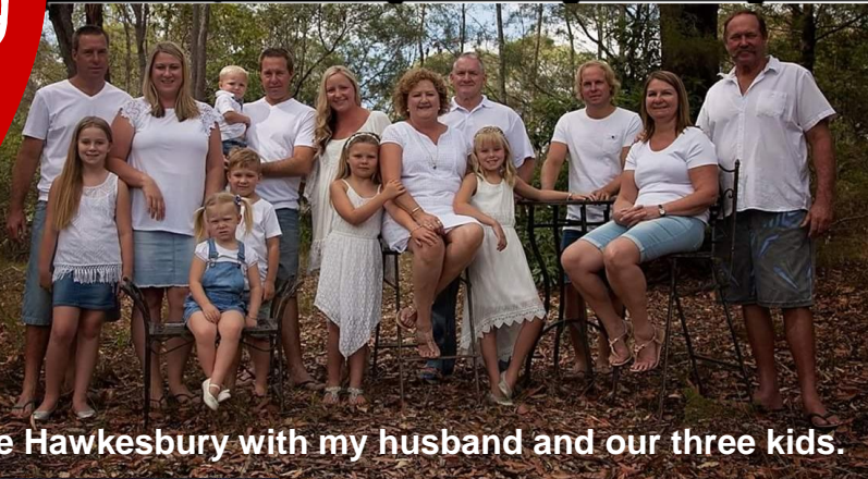
I live in the Hawkesbury with my husband and our three kids.